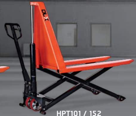
HPT101 / 152