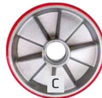
C. Polyurethane Wheel