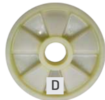
D. Nylon Wheel