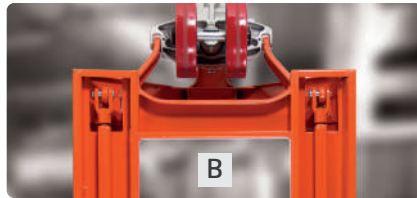
B. Solid Tappet