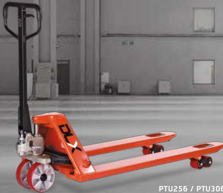
PTU256 / PTU306

REINFORCED FOR ADDED STRENGTH OF LOAD CAPACITY.